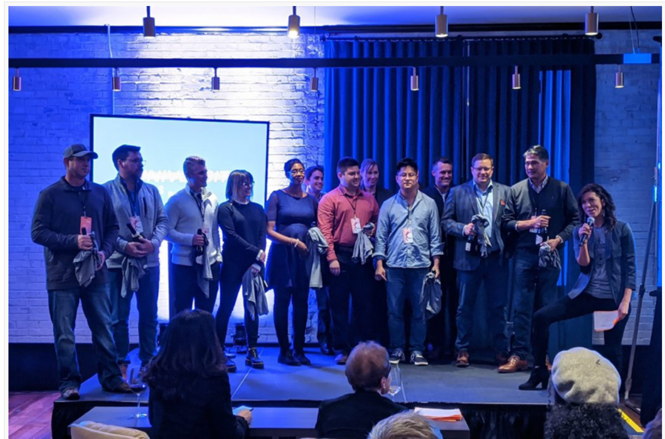
2020 Pipeline fellows

Thursday's event additionally showcased competition between 2019 Pipeline fellows who pitched throughout a daytime contest to earn the titles of best pitch and Innovator of the year.